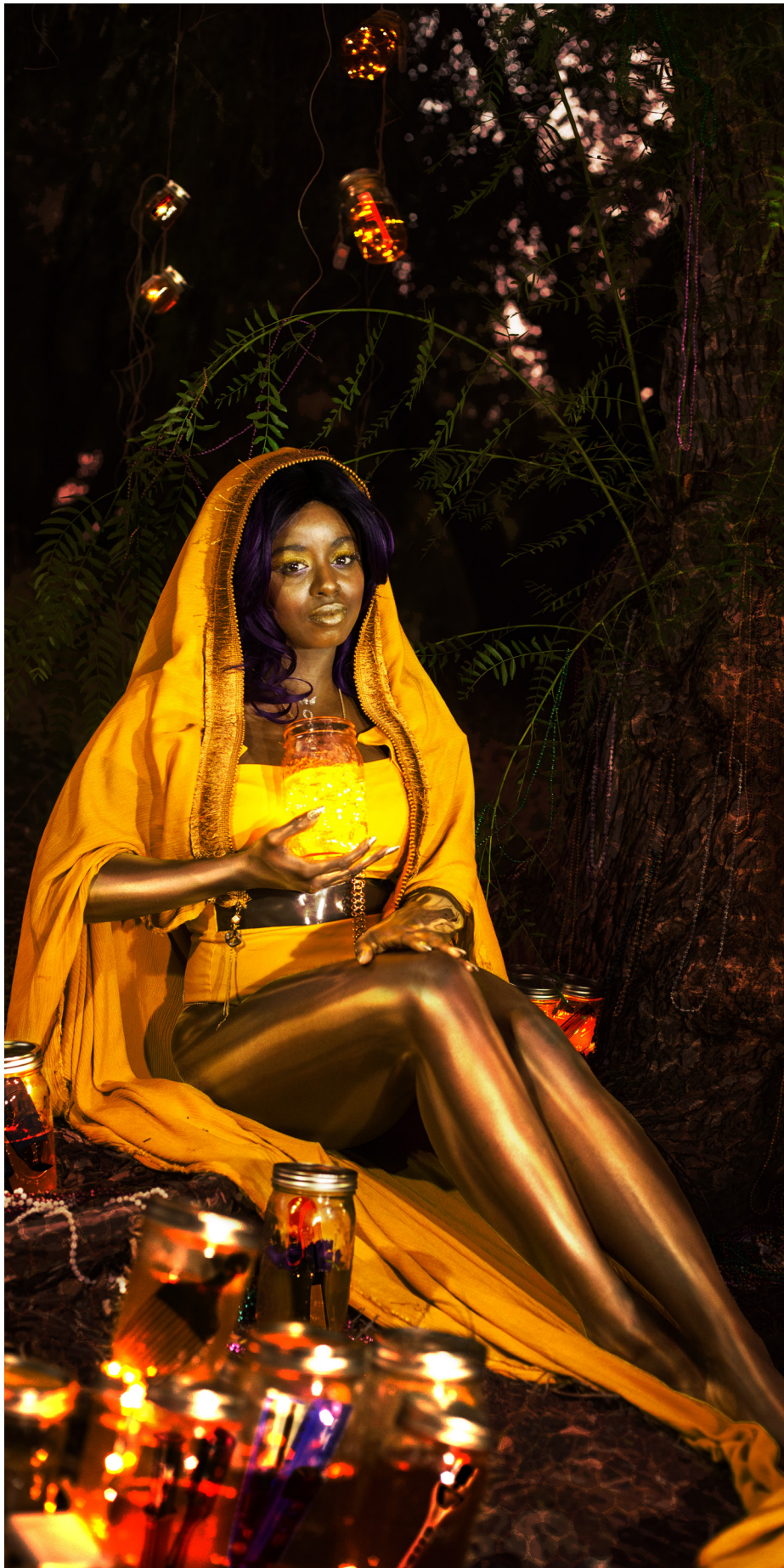
"Oshun: The Weave" 30x60" (2016)