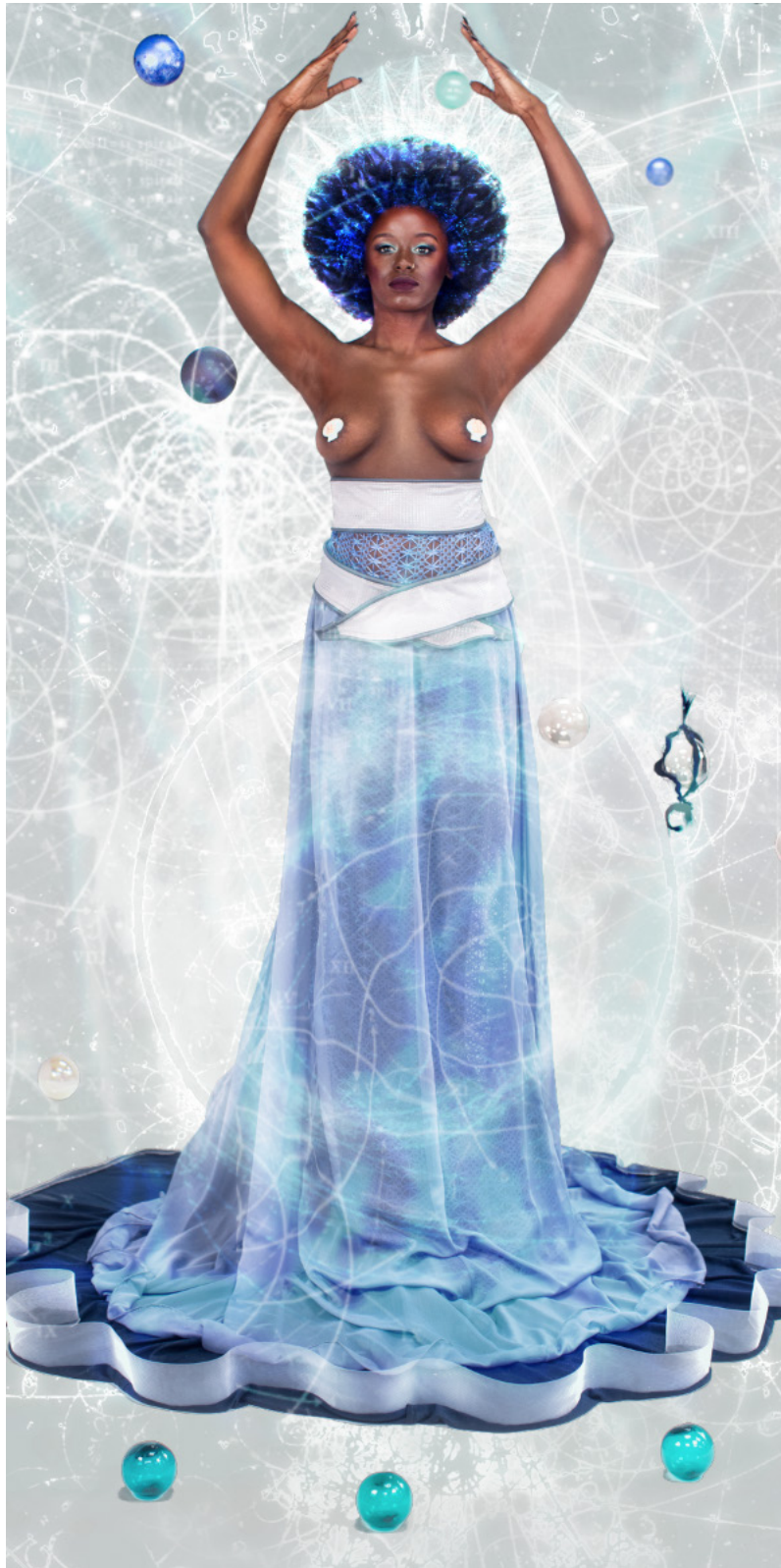
"Yemaya: The Afro" 30x60" (2016)