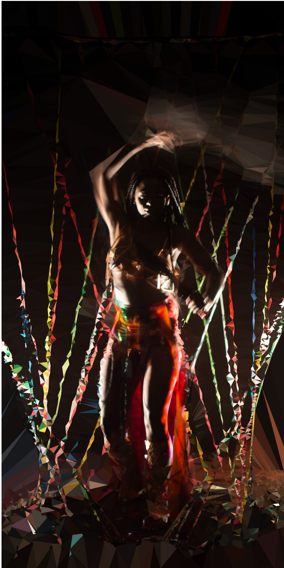
"Oya: The Braids" 30x60" (2016)